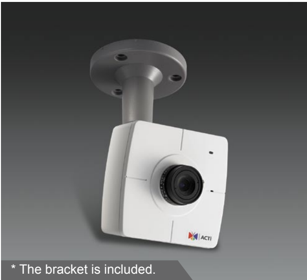
* The bracket is included.